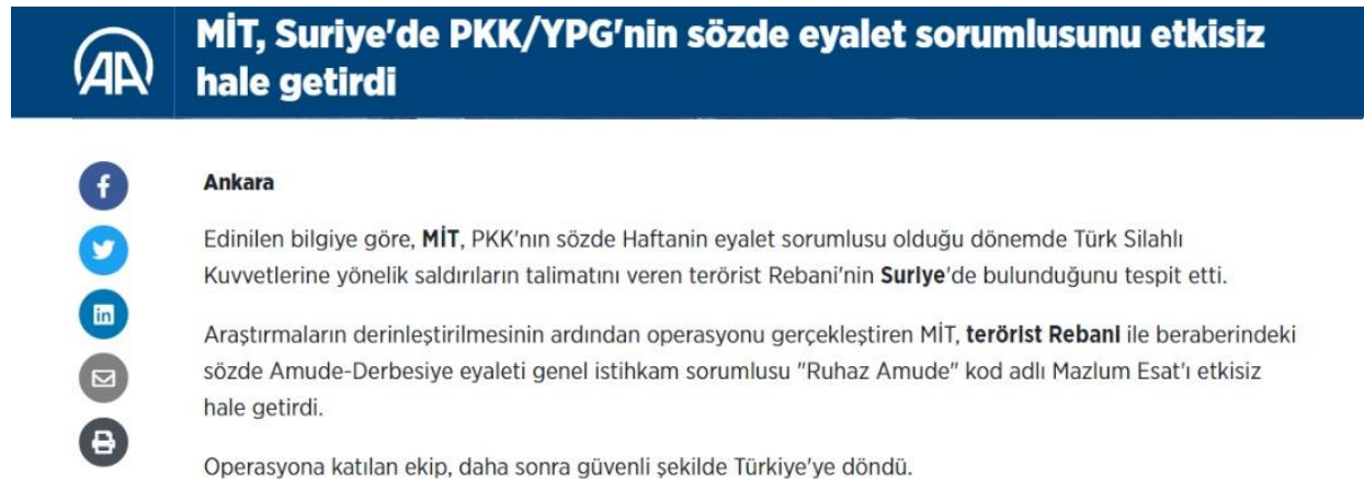
Image No. (02), showing part of the release published by Turkey’s state-owned Anadolu Agency on 12 August 2022, on the killing of Youssef Mahmoud Rabbani, during an operation carried out by Turkish Intelligence (MIT) in Qamishli city.

It is remarkable that Anadolu Agency’s statement “ the team that took part in the operation returned safely to Turkey ”, indicates that some agents of the Turkish (MIT) were inside Syria and participated in the operation against the “Industrial Zone” in the center of Qamishli where it is usually packed with civilians. The agency did not disclose whether a drone was used in the attack or not.