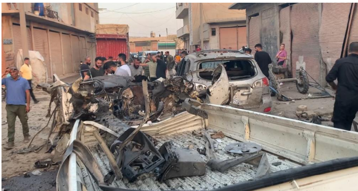
Image no (01), showing aftermath of the blast in the “Industrial Zone” in Qamishli on 6 August 2022.

Initially, only the two children were known to be killed and Alaa al-Din Hussein to be injured. In the evening of that day, the Internal Security Forces (Asayish) of the Autonomous Administration released a statement saying that a Turkish drone hit a car causing an explosion in which four persons including two children were killed and two other civilians were injured. The injured were taken to hospital for treatment. The blast also caused huge material damage to the vehicles and shops near the scene.