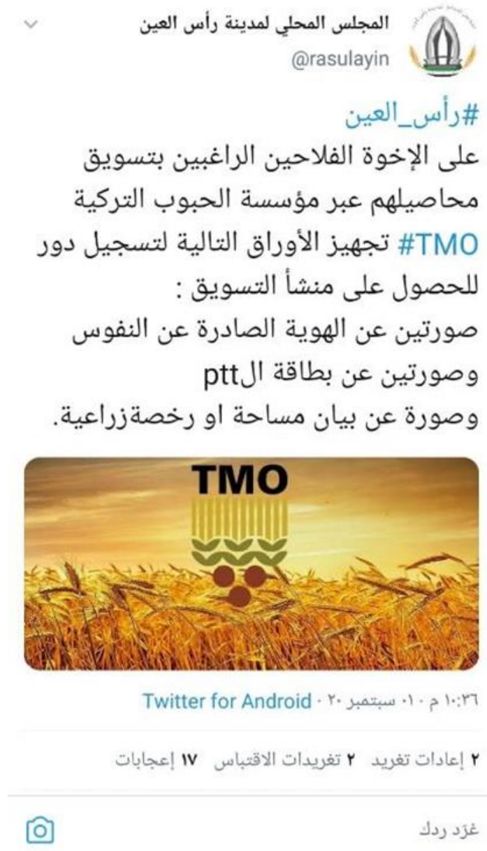
Image 5- An ad marketing grain selling processes through the Turkish Grain Board/TMO, taken from the Ras al-Ayn Local Council's official Twitter account.

Also on its official social media accounts, Ras al-Ayn Local Council had on 1 September 2020 posted that it was hiring employees to work at the Ras al-Ayn Grain Center, established on 1 July 2020. Earlier, on 20 June 2020, the local council reported that Turkey is planning to establish a customs portal in Ras al-Ayn/Serê Kaniyê.