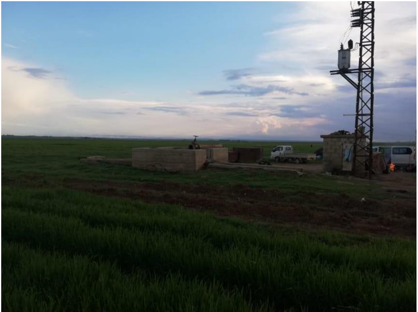
Image 4-These two photos are of the agricultural land owned by the Kurdish displaced man Ayman Daoud, located in Beer Nouh village, seven KM south of Ras al-Ayn/Serê Kaniyê. These photos were taken prior to the Turkish-led Operation Peace Spring.