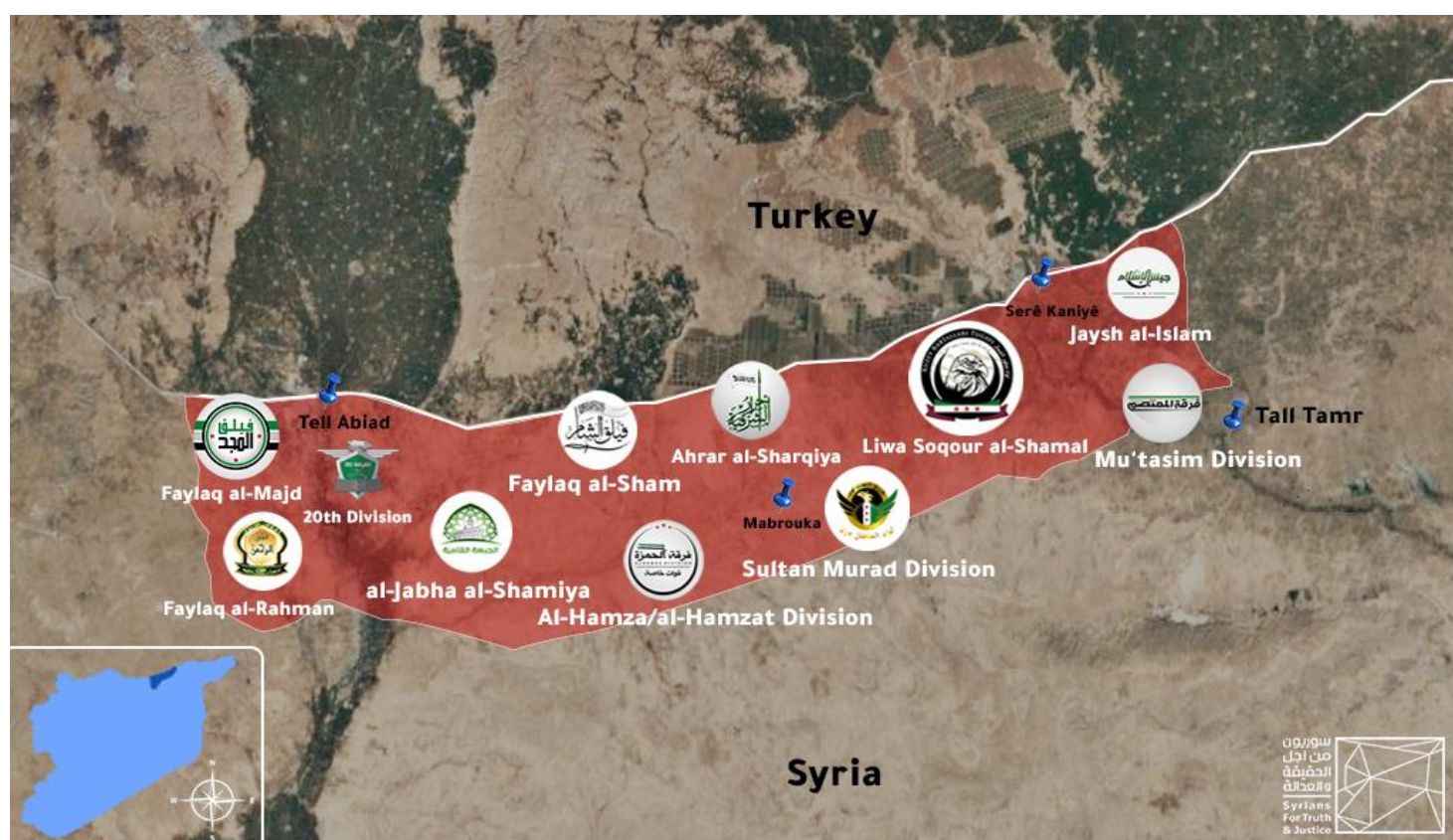
Image 1—Map of the areas were armed groups of the Turkey-backed Syrian National Army (SNA) spread.

Covering the violations committed in Ras al-Ayn/Serê Kaniyê and Tal Abyad, STJ published a series of reports, including one on grain confiscations on 22 July 2020. 1